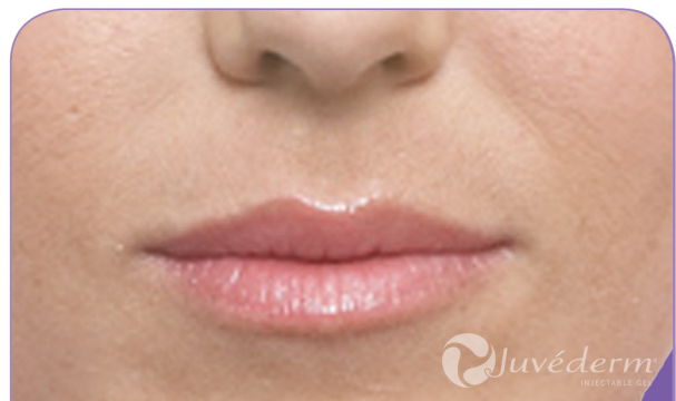
After 1 syringe JUVÉDERM® Ultra (0.8 mL)

Unretouched photographs. Individual results may vary.