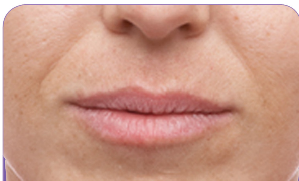
Before JUVÉDERM® treatment